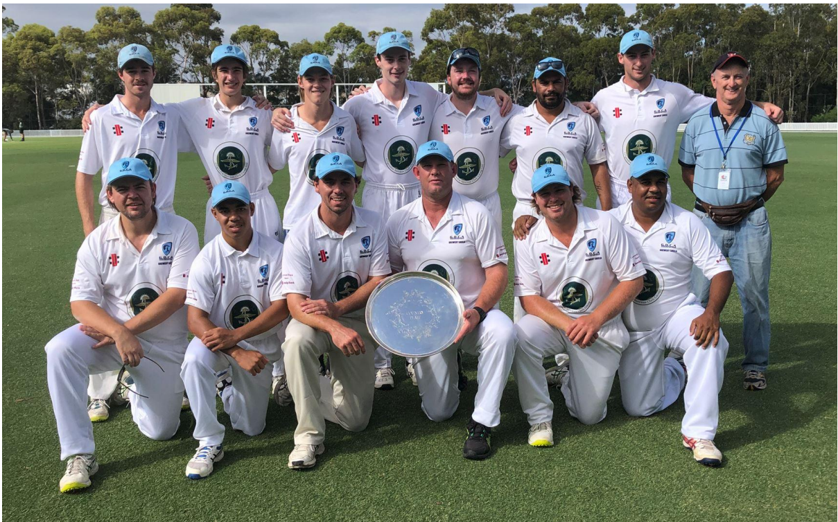
Western Cricket Zone Plate and Country NSW Plate - Winners - Gilgandra DCA