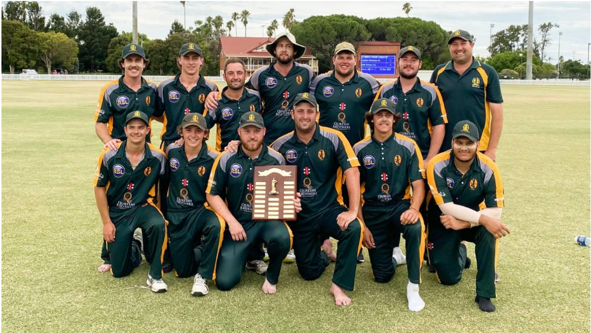
Western Cricket Zone Premier League - Winners - Bathurst DCA